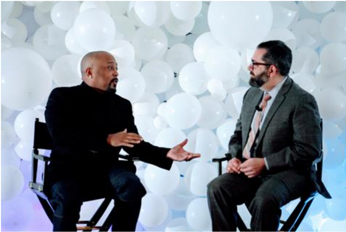
Left to Right: Daymond John and Jeffrey Babin.