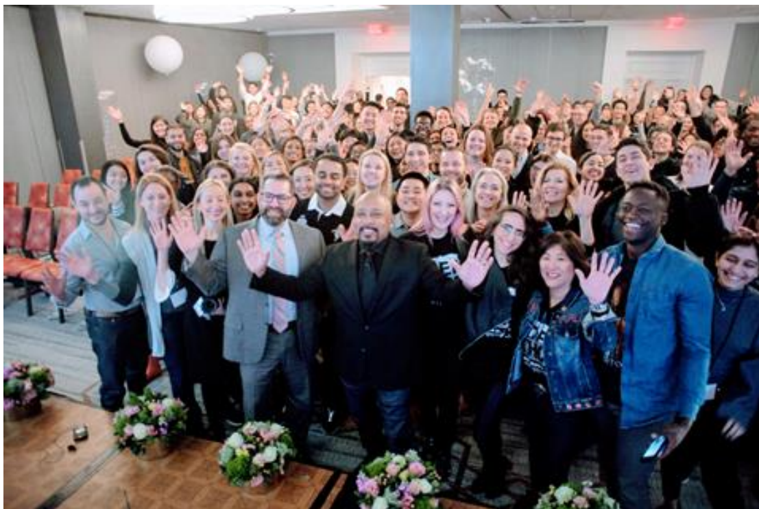
Center: VIP Guest Daymond John and the IDEATHON 2020 audience.