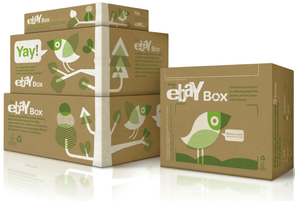
▲ eBay Boxes are designed to be reused and require only a minimal amount of adhesives.