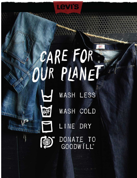
▲ Levi's Care Tag